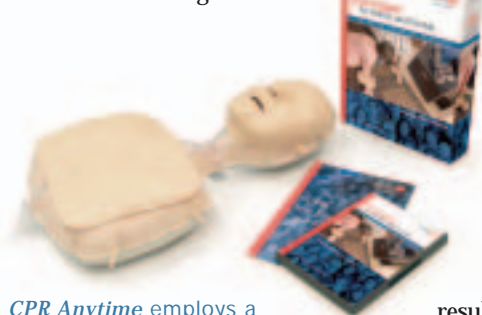
CPR Anytime employs a dynamic video-coaching, "watch-and-do" method to teach users core CPR skills in only 22 minutes.

With this in mind, the AHA and Laerdal Medical Corp. joined forces to develop a new 22-minute learning system that can be used either at home or in groups. The resulting program involves DVD-based learning and an innovative new training manikin.