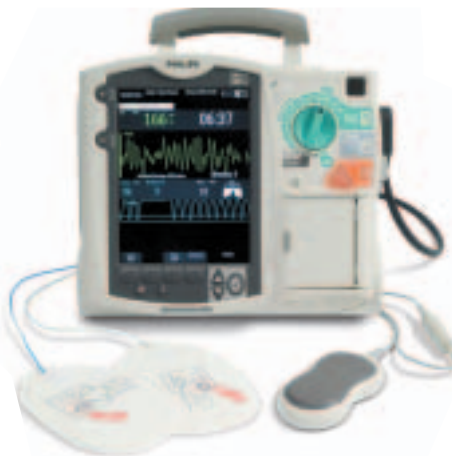
In manual mode, a single ECG wave displays in the top half of the screen, while the compression and ventilation numerics, the lung-shaped ventilation icon and the compression wave appear in the middle.

A calculated compressions-per-minute (cpm) rate, also derived from the compression sensor's signal, is displayed in the screen's upper left corner. If compression depth or rate falls outside AHA guidelines, the monitor/defibrillator provides on-screen signals and delivers corrective