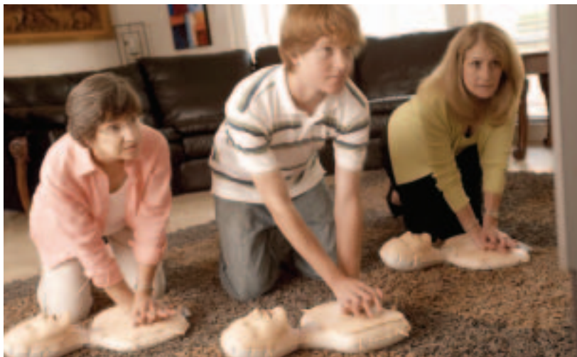
The DVD-based training program can be used any time to reach people who would not otherwise take a traditional CPR course.

A number of years ago the idea of video self-instruction provided a gateway to this older population, with clear proof that video self-learning worked. 3 Although the concept didn't catch hold, the times have changed. The DVD player has become a part of everyday life, and the idea of "watch while you do" is no longer foreign. What's more, this training method works in large facilitated groups, reducing the need to have highly